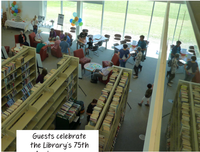
Guests celebrate the Library's 75th Anniversary on June 21, 2014