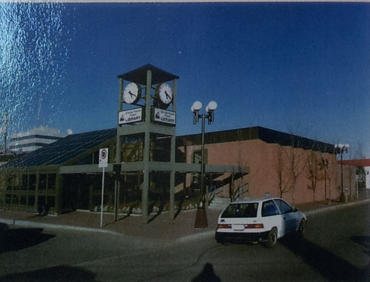
Grande Prairie Public Library housed in the old Liquor Store 1989-2009