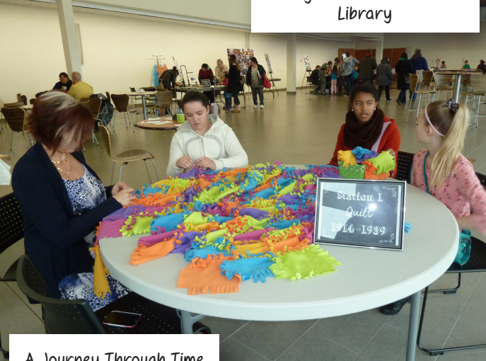
A Journey Through Time Community Art Project