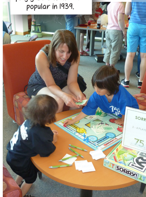
Families gathered to play games that were popular in 1939.