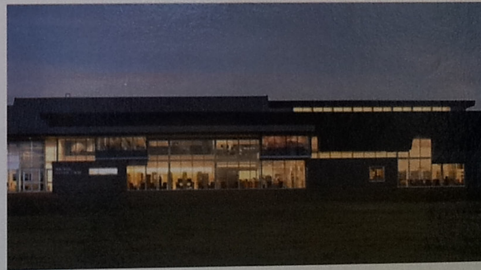
Grande Prairie Public Library ~ our very own home in the Montrose Cultural Centre 2009