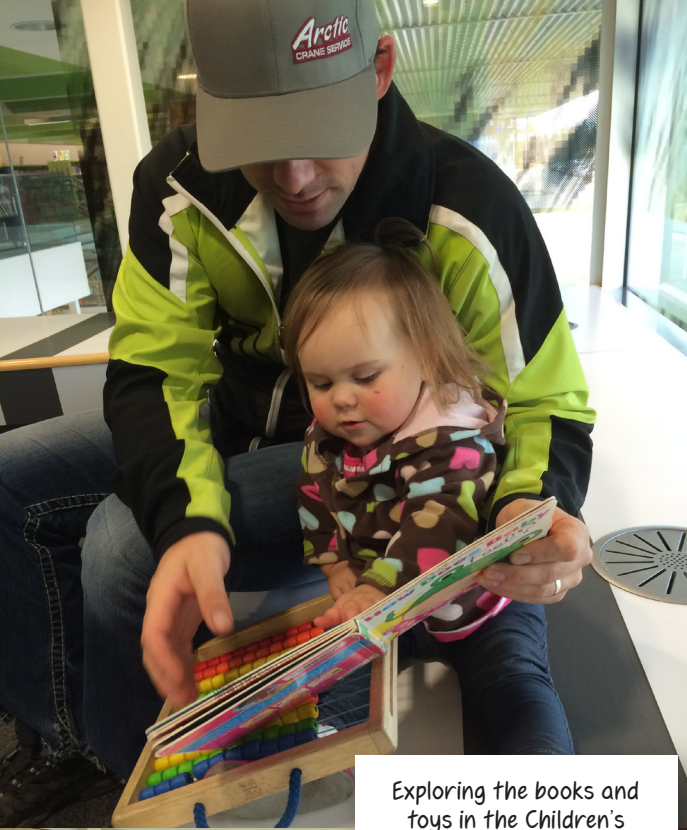
Exploring the books and toys in the Children's Library