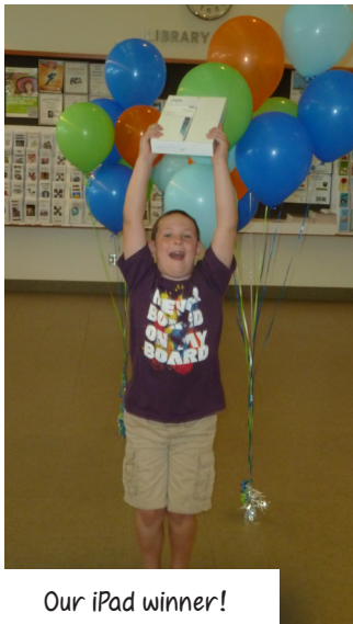
Our iPad winner!

A community celebration was held from 2:00 pm to 4:00 pm. The event was reminiscent of the original opening day in 1939, featuring delicious OMG Cupcakes. Guests enjoyed games and a photo gallery of the Library's history. All those who attended were entered to win an iPad.